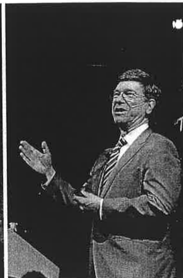
Special Lecture by Prof. Jeffrey D. Sachs