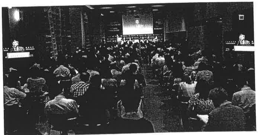
KFAS Conference Hall