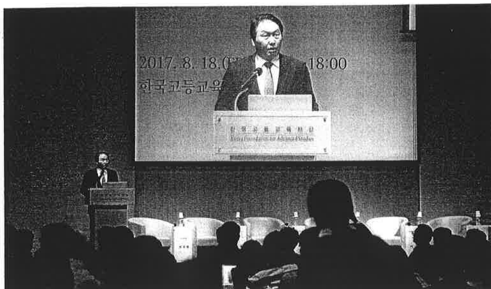
International Conference Commemoration 25 Years of Korea-China Diplomatic Relations