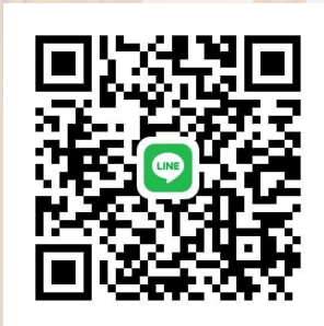
Line QR Code

Call: 02-564-4440-4 ext.7599, 06-6114-1388 (CICM SA)